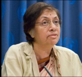
Hon'ble Mrs. Justice Sujata Vasant Manohar, Former Judge, Supreme Court of India.